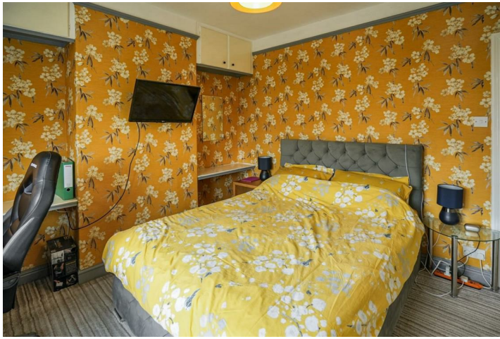
BEDROOM TWO 9'0" x 12'11"